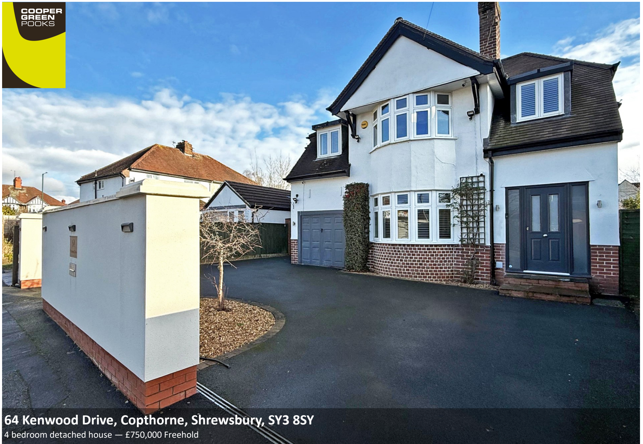
64 Kenwood Drive, Copthorne, Shrewsbury, SY3 8SY

4 bedroom detached house — £750,000 Freehold